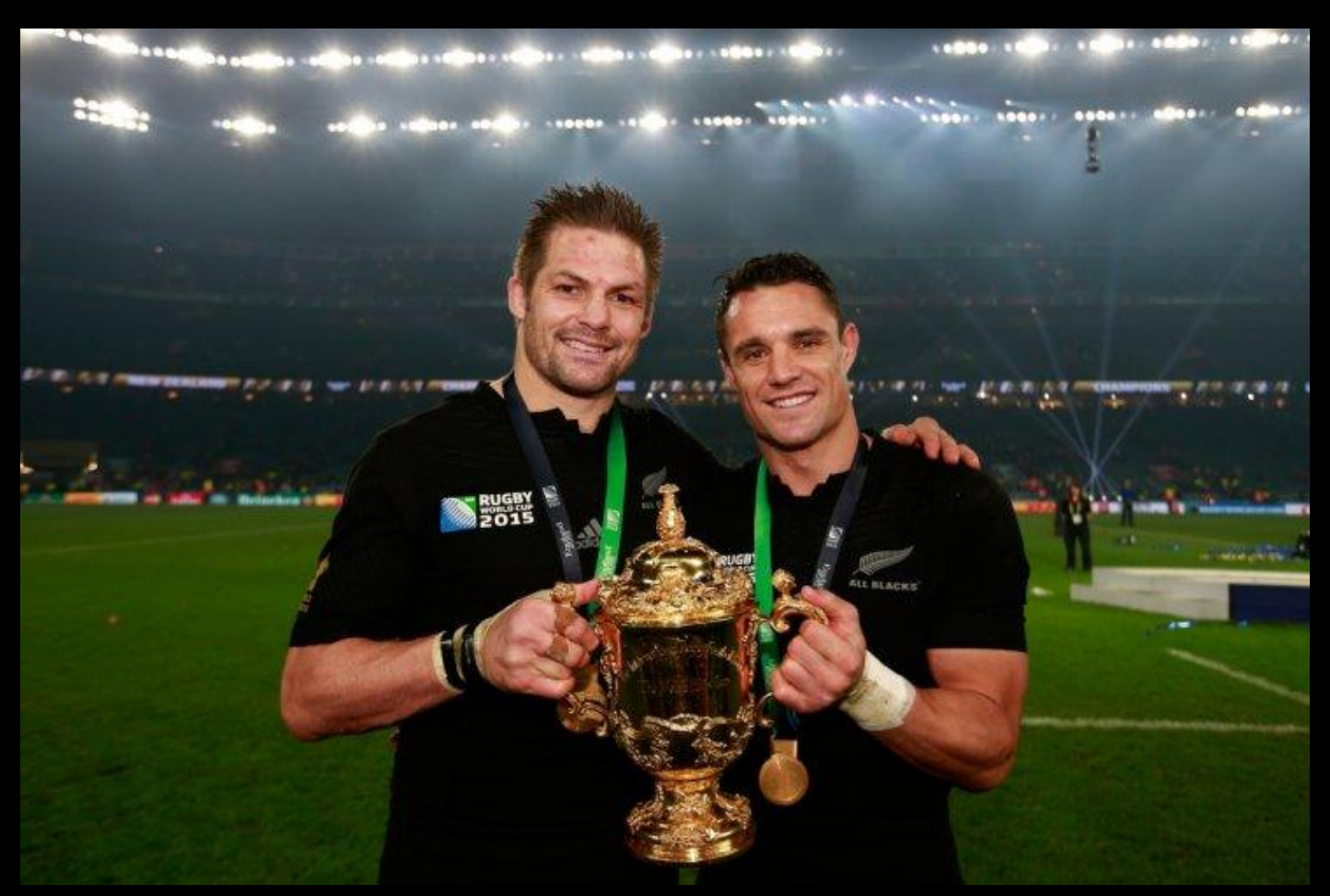
Winners of the 2015 Rugby World Cup